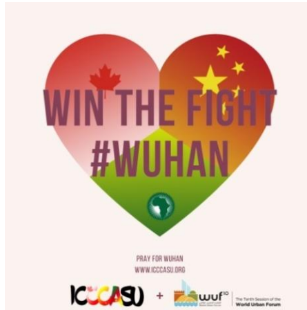
Poster for Wuhan