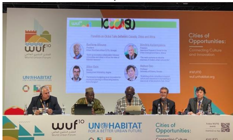
Global Talks between Canada, China and Africa