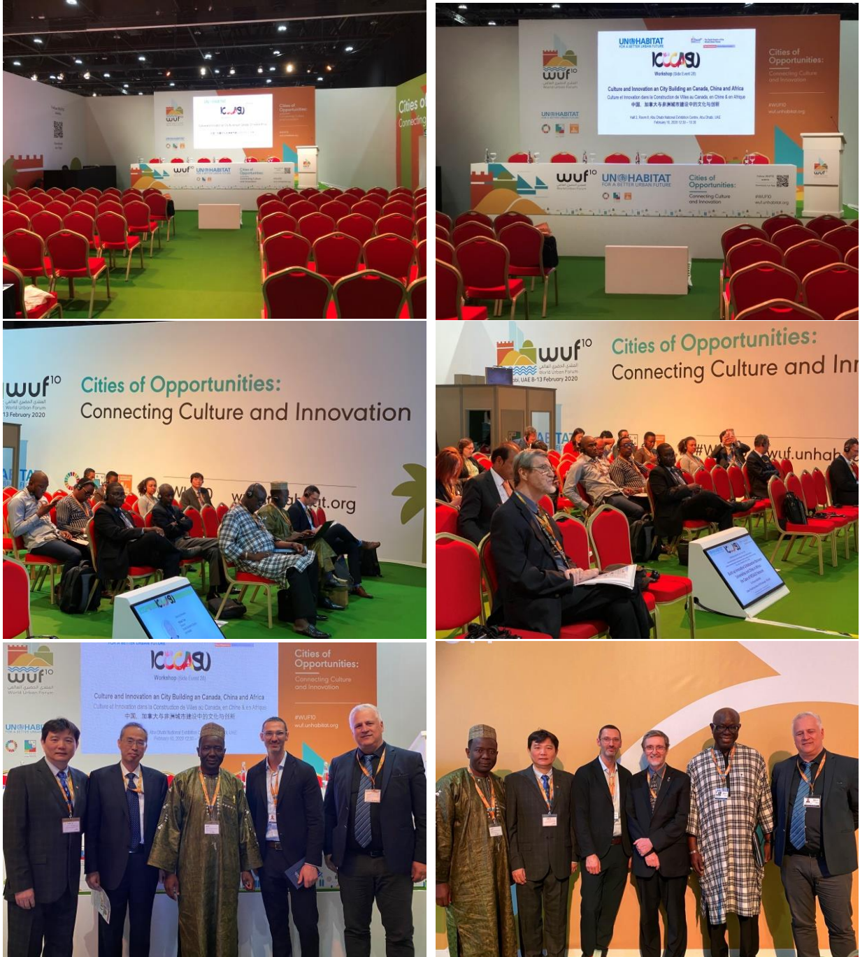
ICCCASU Workshop Main Conference Room