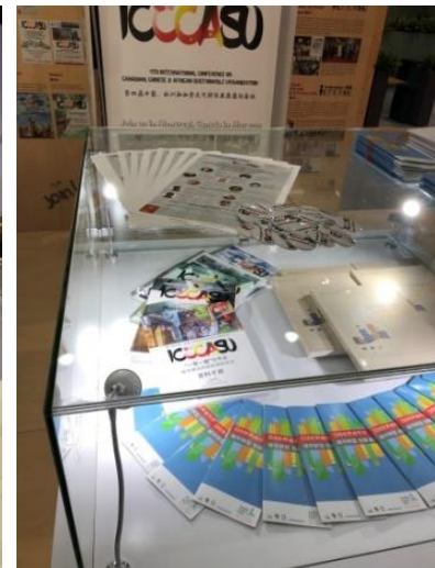
ICCCASU in China Pavilion