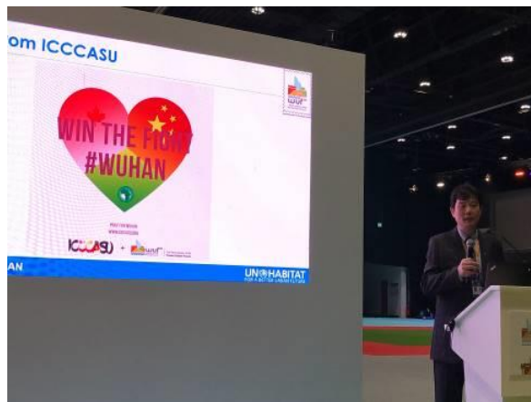
ICCCASU in WUF for Wuhan session