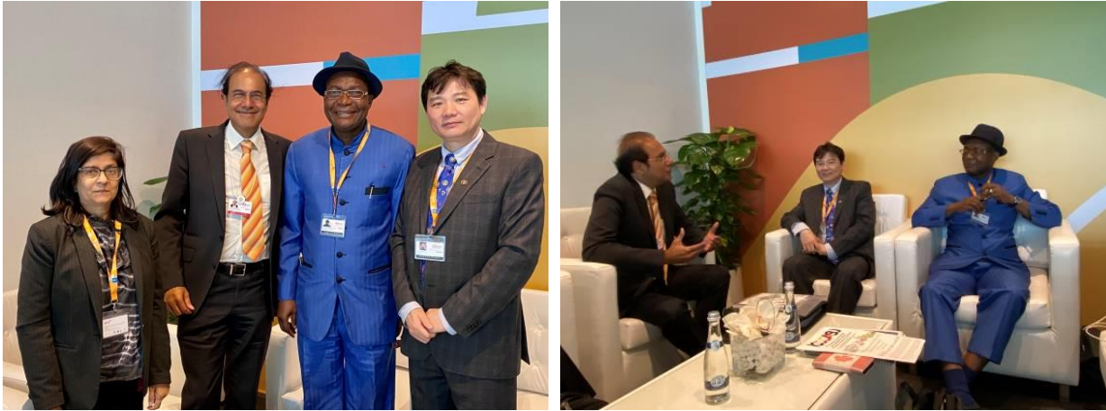
Meeting with the Minister of Housing and Land Use Planning for the Republic of Mauritius