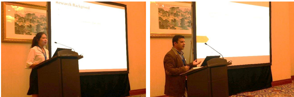
Panel speakers ICCCASU3 小组演讲