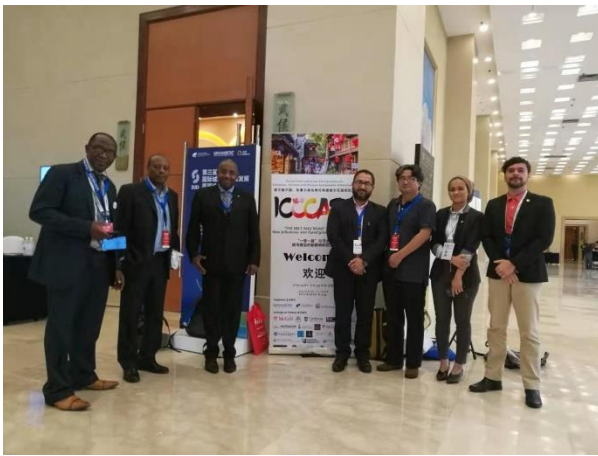
Panel F 部分嘉宾合影 Panel F Delegates