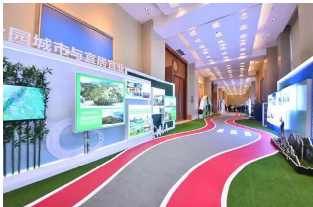
成都可持续发展成就展 Chengdu Sustainable Development Exhibitions

Following the Award Ceremony attendees attended the Conference Gala: Night of Chengdu. Conference delegates visited the Chengdu Traditional Culture Exhibition and the Sustainable Development Exhibition and tasted traditional foods from the region around Chengdu. The delegates were impressed by the history and culture of Chengdu, and well as the more recent advances in the modernization and urbanization of the city.