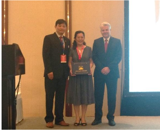
ICCCASU 表彰仪式 ICCCASU Awards Ceremony