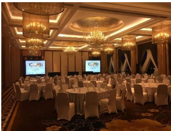
ICCCASU3 大会主会场 ICCCASU3 Main Conference Room

本次会议以“一带一路”与节点： 城市建设的新影响与新范式 为主题，探讨中国、加拿大和非洲国家目前的城市发展模式，以确定如何在一系列地理、历史、政治和经济背景下，更好地解决脆弱性、降低不稳定性，提高效率、促进繁荣与智能城市发展，并审视制约可持续城市发展的地方和全球问题，确定应当建立的机制，以改进地方和全球城市空间治理。围绕“发展、平等和包容”、“城市土地利用、可持续发展与生态文明”、“气候变化与建成环境应对”、“智能技术与城市智能”、“城市更新与棚户区改造”、“产业园区、农业加工区与工业型城市转型”等六大主题，来自全球 23 个国家的近 150 名代表共聚成都，共同探讨世界快速城镇化地区在城市发展方面面临的问题。