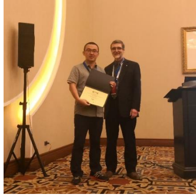
优秀海报颁奖仪式 Poster Award Ceremony