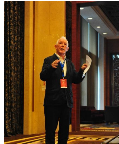
Keynote speakers ICCCASU3 主旨演讲