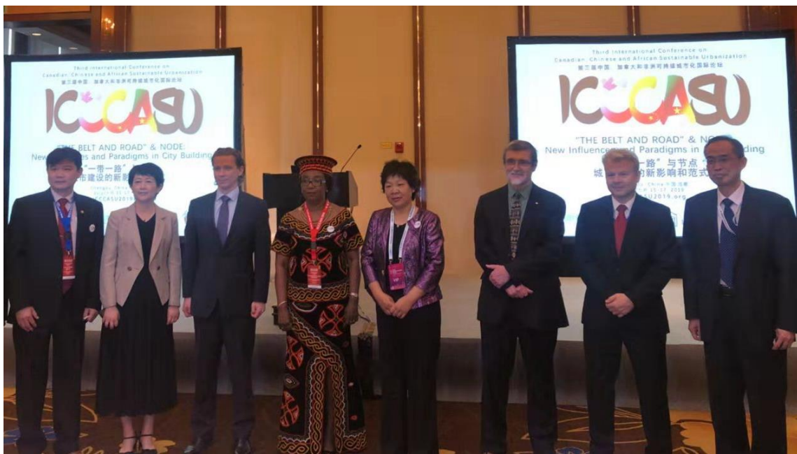
致辞嘉宾合影 Guest Speakers